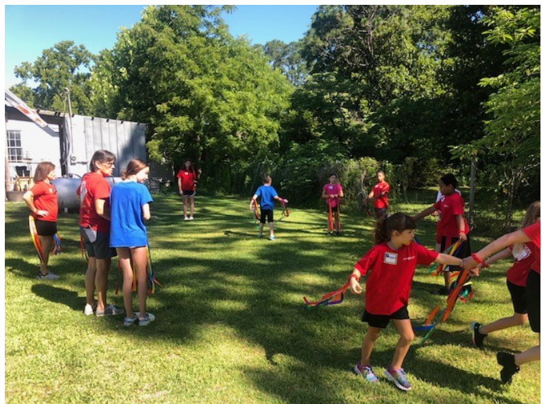
Above: Having fun dancing in the garden.