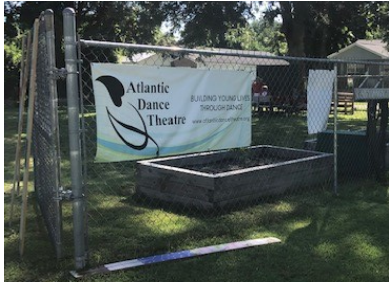
Atlantic Dance Theater partner banner on fence.

Music isn't extra. Music isn't additional. Music isn't discretionary. Music isn't an add-on. And, music isn't disposable. Music education is core. It's fundamental. It's necessary. It's an irreplaceable component of holistic and meaningful education That's what music is.