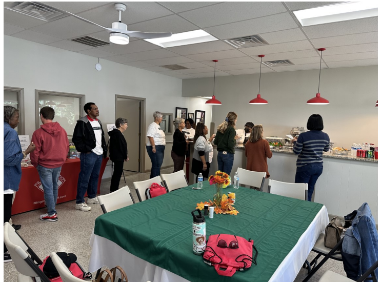
Top L: Cohort #2 visiting Town of Pollocksville Town Hall and learning more about local government with Mayor Jay Bender.