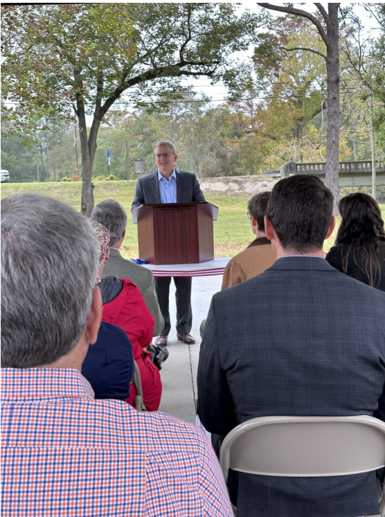
Left: Group being addressed by NC Attorney General Josh Stein