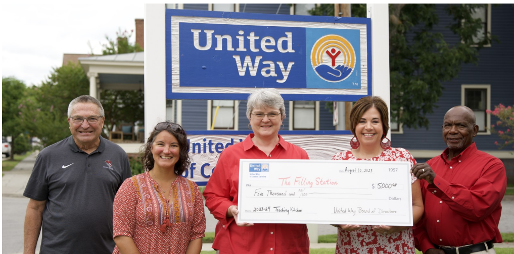
Thank you United Way of Coastal Carolina for the grant funds to support the teaching kitchen programming.