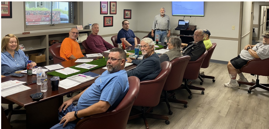
Below: Thank you to the New Bern Amateur Radio Club for partnering with us to offer the Ham Radio General License course. Thank you Jones County Emergency Management for helping us promote this important skill.