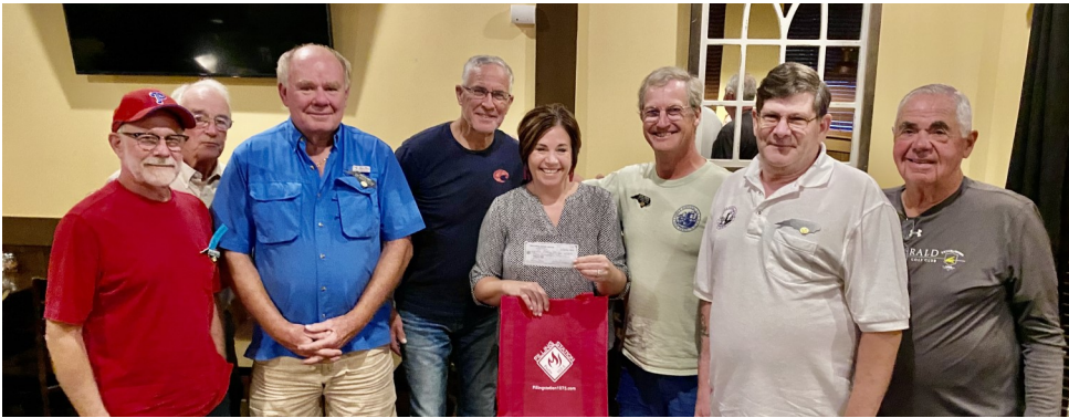
Above: Thank you First Capital Antique Car Club for your sponsorship of the Perfect 10 event.