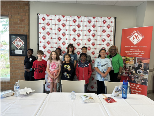
Great to partner with Pollocksville Elementary School "Leader in Me" program - group visited to learn more about The Filling Station story and take a tour