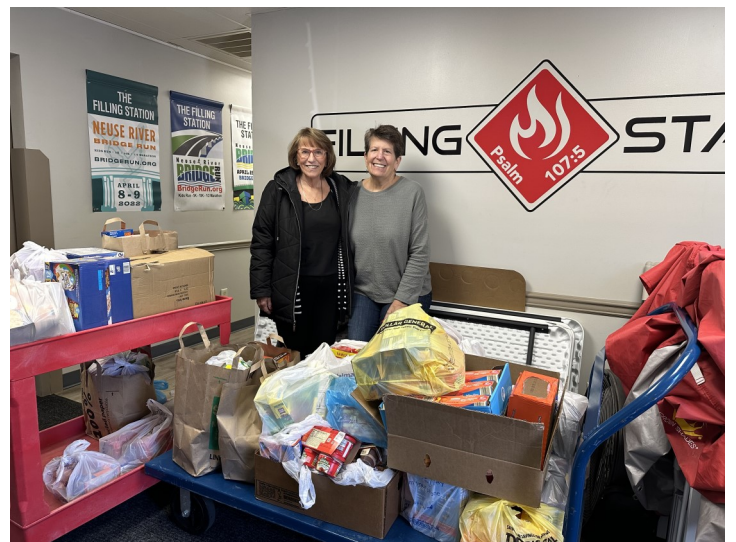
Thank you to the Catholic Daughters from St. Paul's Church for the generous donation of snacks for our food pantry.