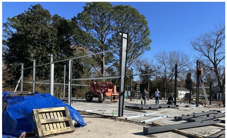
Warehouse taking shape