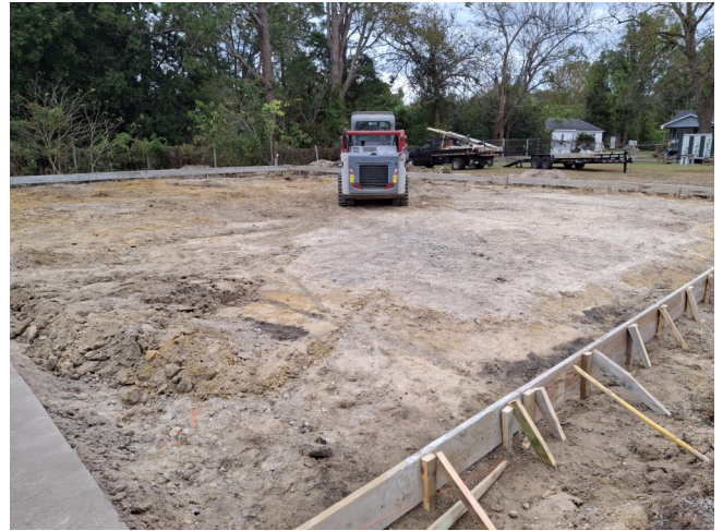
Preparing for New Warehouse