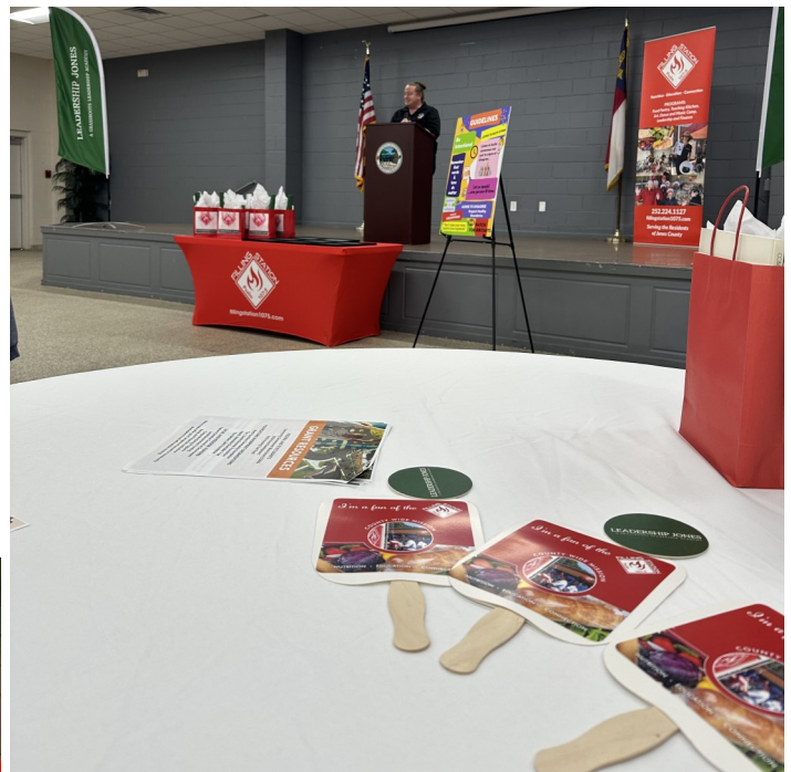
Leadership Jones Graduation - Thank you to the Jones County Civic Center for hosting