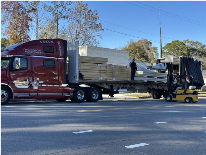
Truck from Wisconsin delivered the freezer and refrigeration panels for the new warehouse