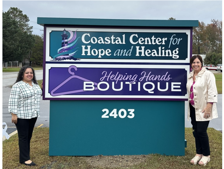
Thank you Coastal Center for Hope and Healing for your partnership all year long