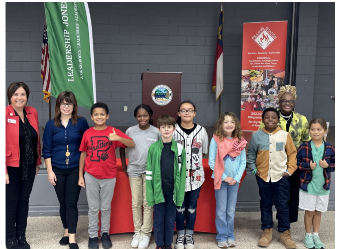
Pollocksville Elementary School "Leader in Me" group attended the Leadership Jones Graduation