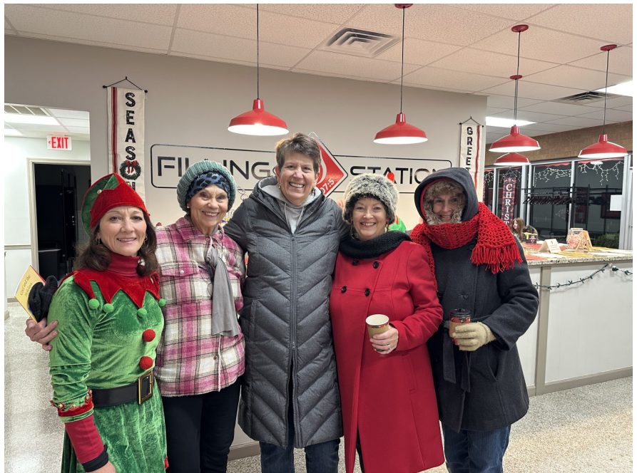
Christmas on Main Elves and Friends gathering in the Front Lobby