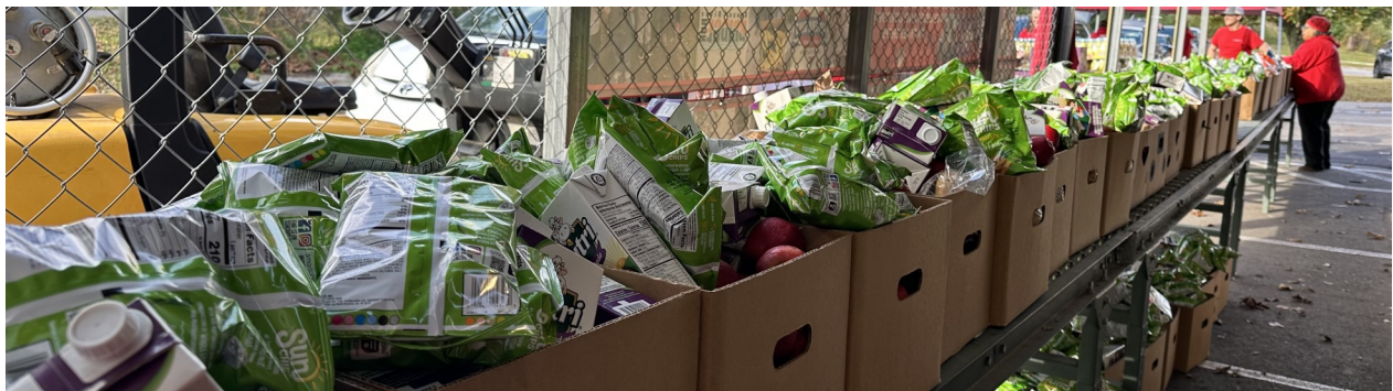
Food Pantry - Wonderful Healthy veggies from the Food Bank of CENC