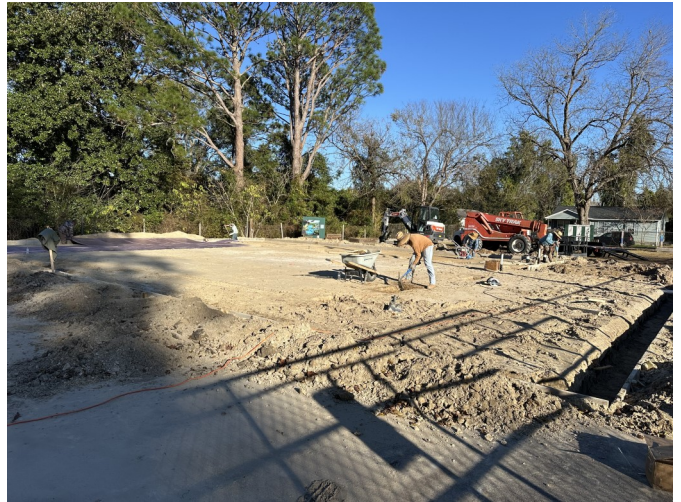
Continued progress preparing for the new warehouse