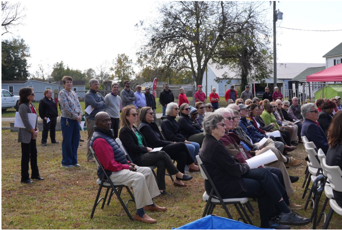
Approximately 80 people in attendance for the Groundbreaking Ceremony on November 13, 2024