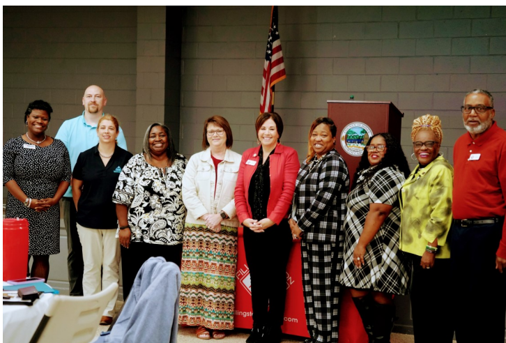
Leadership Jones Graduates Nov 2024

Leadership Jones Graduation - Thank you to Chick Fil-A and State Employees Credit Union for funding this leadership program