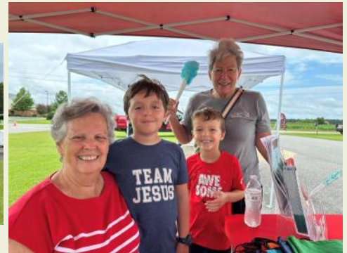
We enjoyed supporting N.C. Farm Bureau at Jones County Field Fest on Aug 2, 2025

Thank you to our amazing volunteers and board members for your continued support of partnership events.